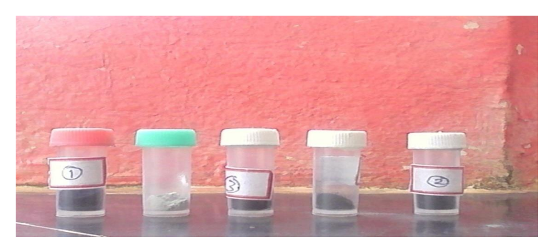
Fig 1: Prepared Samples of TiO<sub>2</sub>